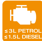
≤ 3L PETROL ≤ 1.5L DIESEL

New Boost function allows user to restart vehicles with depleted batteries