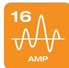
Connects to any 16A (3 phase) charging unit or station with a type 2 connection.

Charge at home and on the moveType 2 to Type27 PIN | 3PHASE